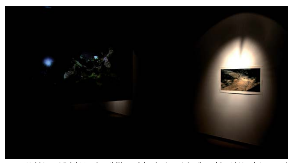
Hold (2010) Exhibition Detail (Eloise Calandre (2010) Cradle and David Mutch (2009-10) Untitled #10 ).

David Mutch's single photographic image Untitled #10 from The Tourist series (2009 -2010) depicts a carefully framed landscape marked by deep shadows and a washed-out colour palette. The landscape provides a background on which a single figure walks along a desolate unsealed road. Just as Yardley's work suggests narratives beyond the frame, this image speaks of the road travelled and the road yet to be travelled. This presumed narrative, evoked here in a photograph with a 16:9 cinematic ratio and carefully constructed aesthetic, suggests a cinematic freeze frame.