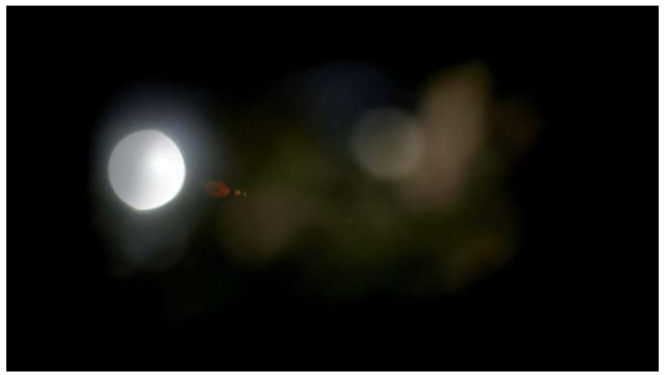
Eloise Calandre (2010) Cradle, Video Still.

specifically visual about this kinetic change. The effect is not only perceived visually, but it reproduces an effect of the human eye.