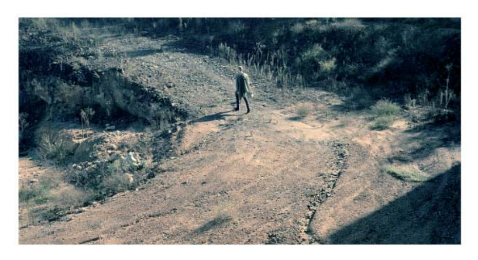
David Mutch (2009-10) Untitled #10 from the series The Tourist , Photograph.

Untitled #10 oscillates between photography and cinema, and in so doing reproduces the tension between stillness and motion at the heart of the moving image. The still photogram, which comprises all moving images, is erased by the projector's motion when viewed at twenty-four frames a second. Furthermore, the materiality of the image is erased in cinema as the sequence of stills is projected in motion.