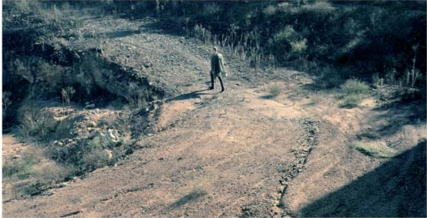
David Mutch (2009-10) Untitled #10 from the series The Tourist , Photograph.

Untitled #10 oscillates between photography and cinema, and in so doing reproduces the tension between stillness and motion at the heart of the moving image. The still photogram, which comprises all moving images, is erased by the projector's motion when viewed at twenty-four frames a second. Furthermore, the materiality of the image is erased in cinema as the sequence of stills is projected in motion.