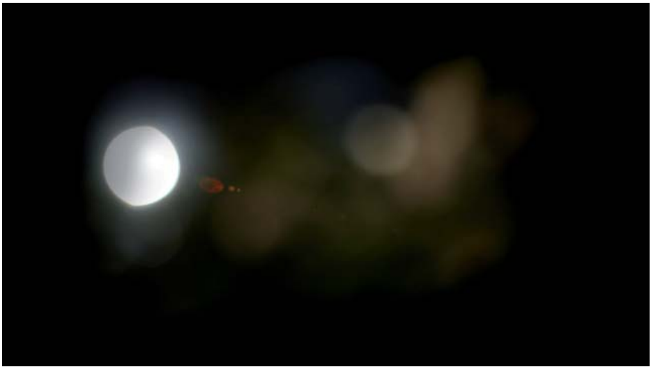
Eloise Calandre (2010) Cradle , Video Still.

specifically visual about this kinetic change. The effect is not only perceived visually, but it reproduces an effect of the human eye.