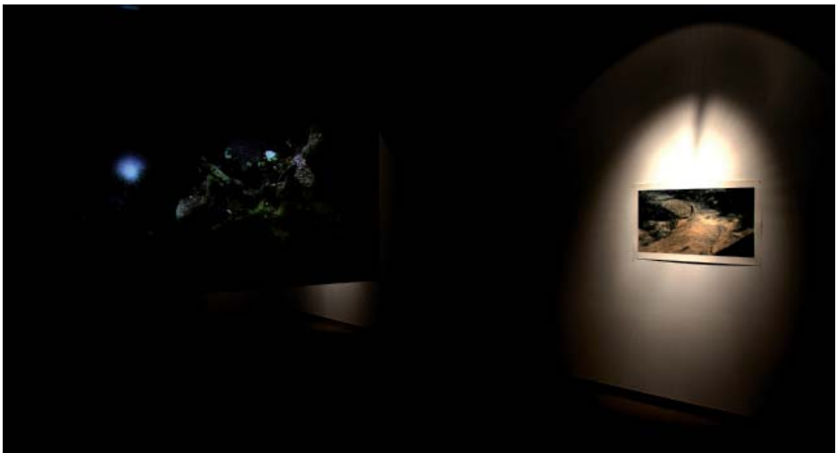
Hold (2010) Exhibition Detail (Eloise Calandre (2010) Cradle and David Mutch (2009-10) Untitled #10 ).

David Mutch's single photographic image Untitled #10 from The Tourist series (2009 -2010) depicts a carefully framed landscape marked by deep shadows and a washed-out colour palette. The landscape provides a background on which a single figure walks along a desolate unsealed road. Just as Yardley's work suggests narratives beyond the frame, this image speaks of the road travelled and the road yet to be travelled. This presumed narrative, evoked here in a photograph with a 16:9 cinematic ratio and carefully constructed aesthetic, suggests a cinematic freeze frame.